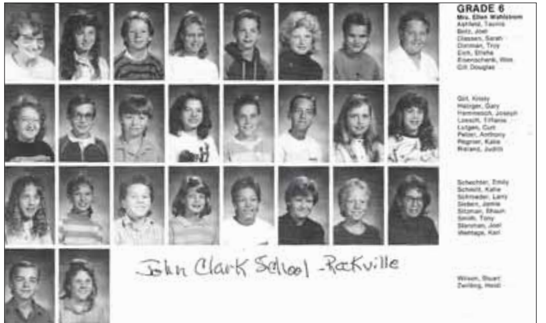
All you "old" 6th graders from Rockville. Enjoy the memories!!! Tудie 252-3017.

The group sponsors a program where old fishing rods and reels can be refurbished and reused. The drop off point is behind the Hideaway Bar.